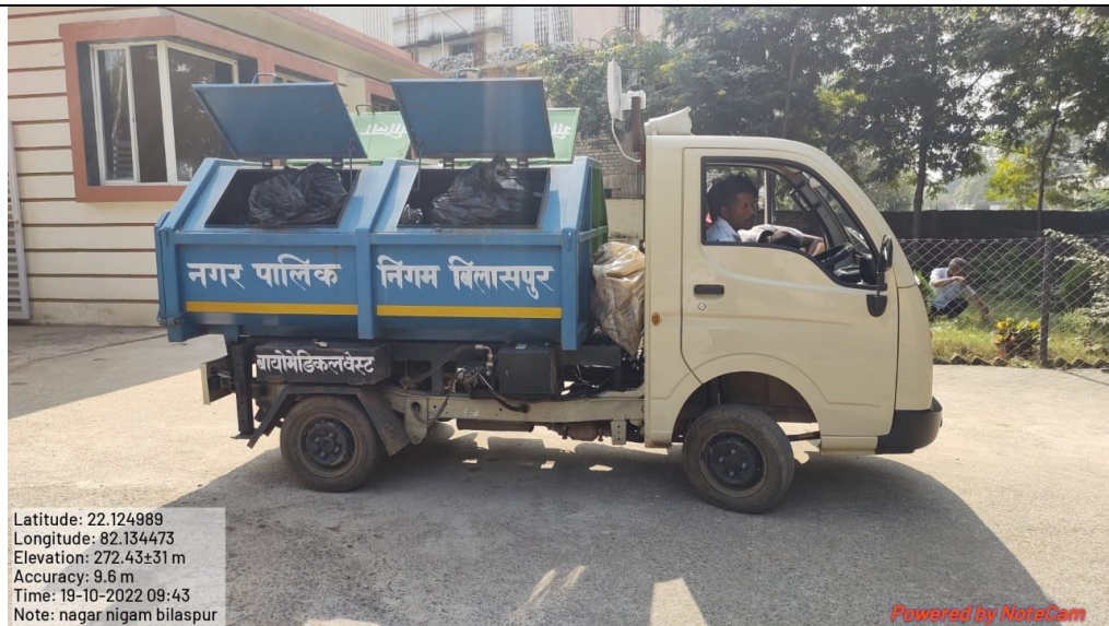
Waste Disposal outside University Campus 22°12'49.1"N 82°13'44.6"E