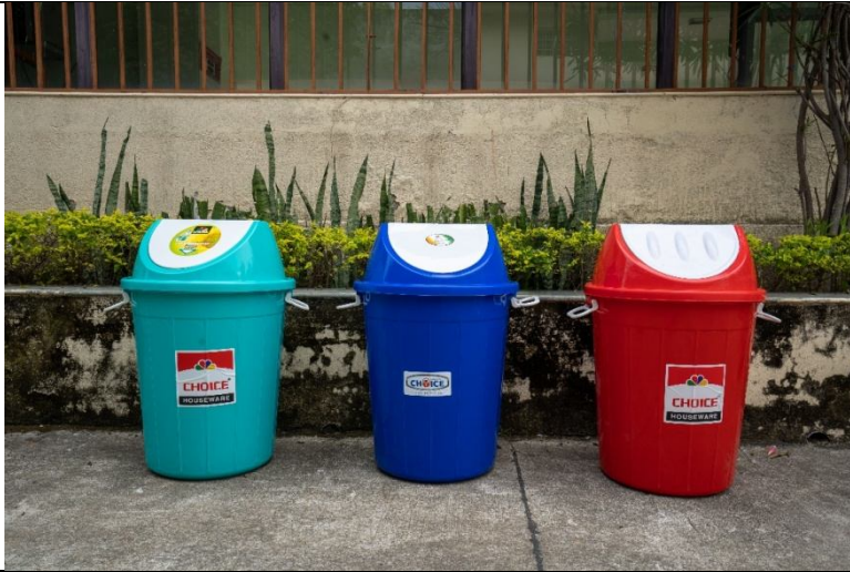
Inorganic Waste Extraction from Campus 22°07'36.1"N 82°08'20.6"E