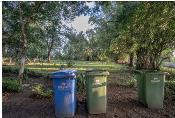
Disposal of Inorganic Waste in Campus 22°07'31.1"N 82°08'33.1"E