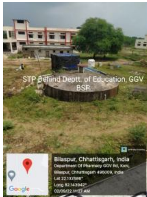
STP behind Department of Education