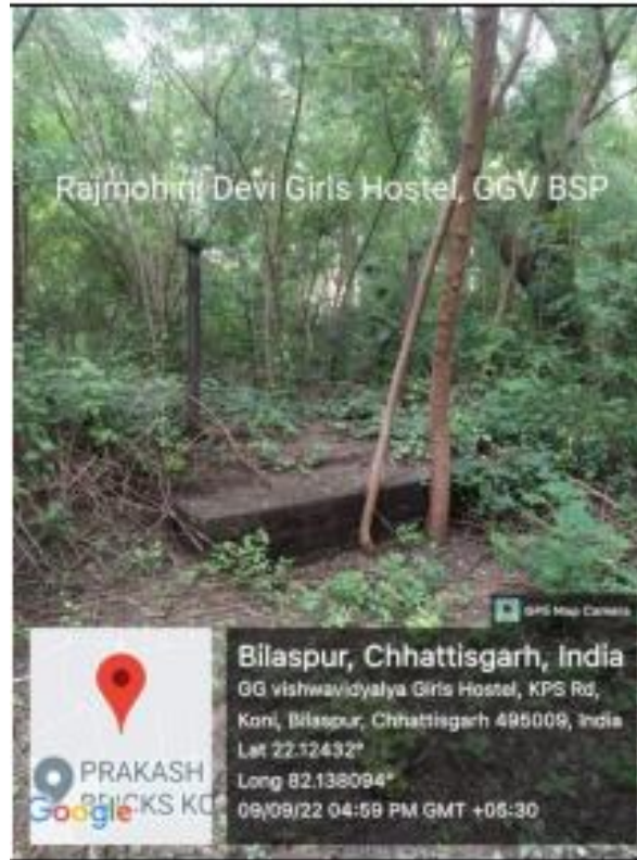
STP Near Rajmohini Devi Girls hostel