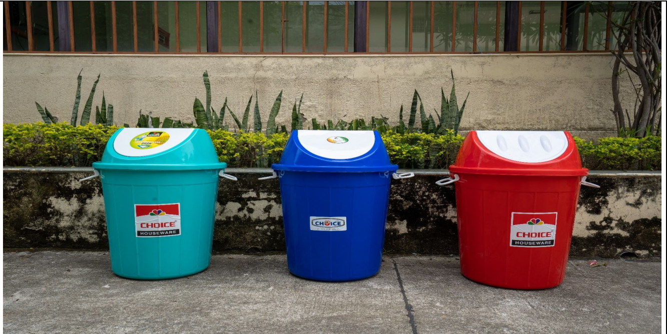
Toxic Waste Disposal in University Campus 22°07'36.1"N 82°08'20.6"E